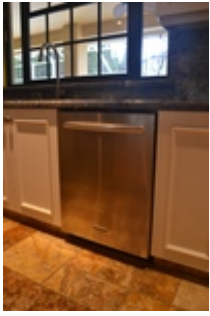
DSC_0021.jpg Upload Date: 08 Dec 2016

Date Purchased: Quantity: 1 Total Value: Condition: Good Brand: Serial Number: