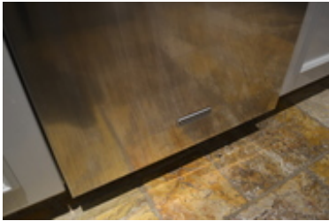
DSC_0022.JPG Upload Date: 08 Dec 2016

Date Purchased: Quantity: 1 Total Value: Condition: Good Brand: Serial Number: