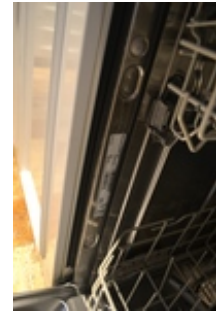
DSC_0024.jpg Upload Date: 08 Dec 2016