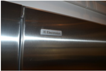
DSC_0002.JPG Upload Date: 08 Dec 2016

Date Purchased: Quantity: 1 Total Value: Condition: Good Brand: Serial Number: