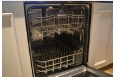
DSC_0023.JPG Upload Date: 08 Dec 2016