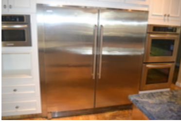
DSC_0001.JPG Upload Date: 08 Dec 2016

Date Purchased: Quantity: 1 Total Value: Condition: Good Brand: Serial Number: