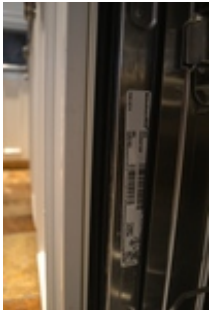
DSC_0025.jpg Upload Date: 08 Dec 2016