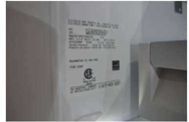
DSC_0004.JPG Upload Date: 08 Dec 2016