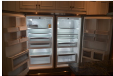
DSC_0003.JPG Upload Date: 08 Dec 2016